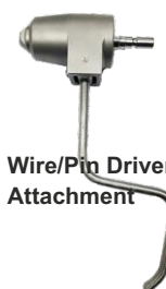
Wire/Pin Driver Attachment